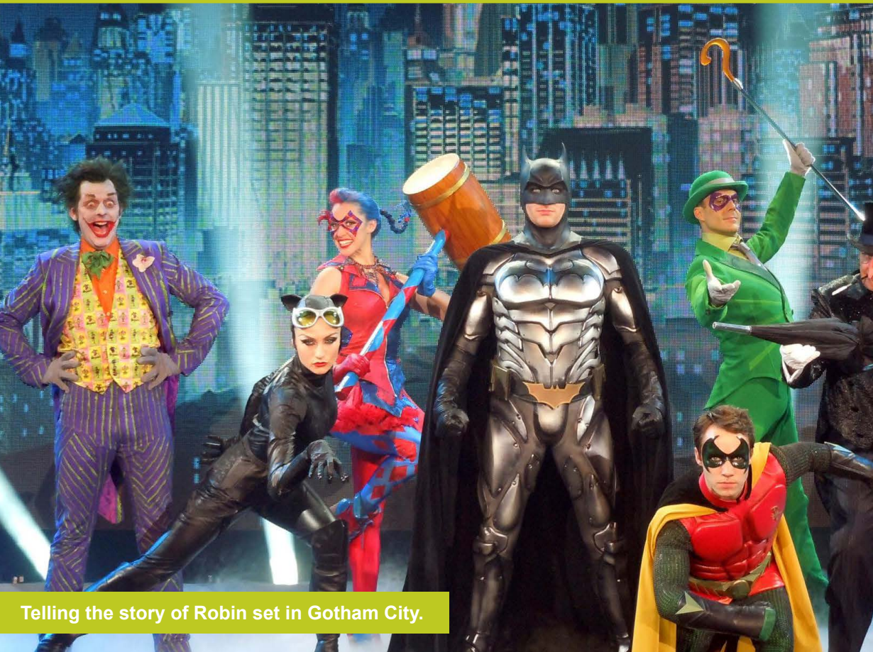
Telling the story of Robin set in Gotham City.