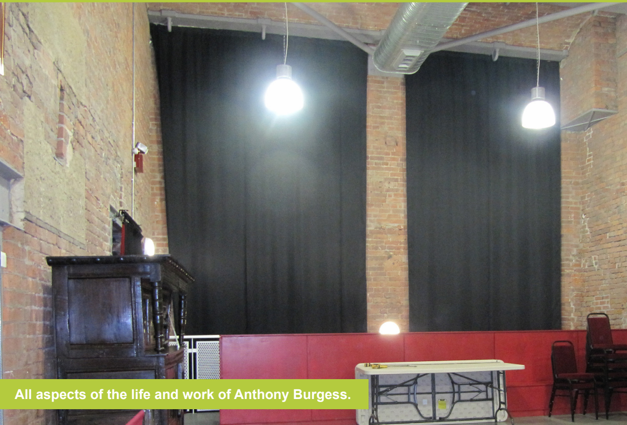
All aspects of the life and work of Anthony Burgess.