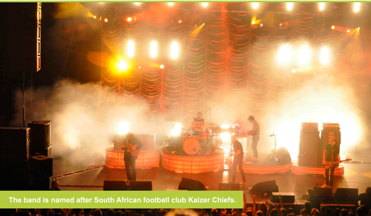
The band is named after South African football club Kaizer Chiefs.